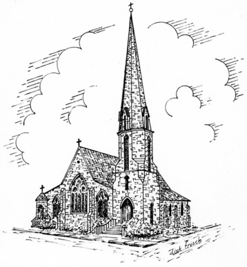
Grace Episcopal Church Honesdale, Pa. Founded 1882